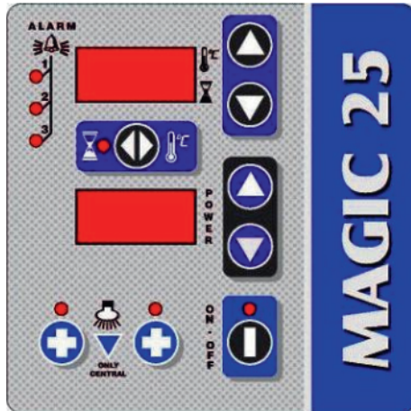
Magic 25 control panel