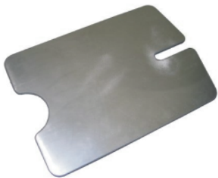
Alluplan printing pallets