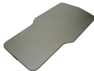
Alluplan printing pallets