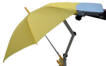
Printing pallets for umbrellas