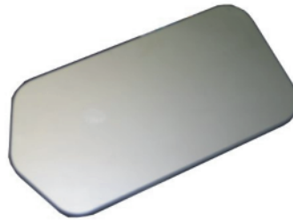
Alluplan printing pallets