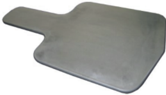
Alluplan printing pallets