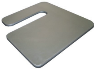
Alluplan printing pallets