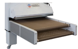
DOUBLE RETURNING BELT CONVEYOR