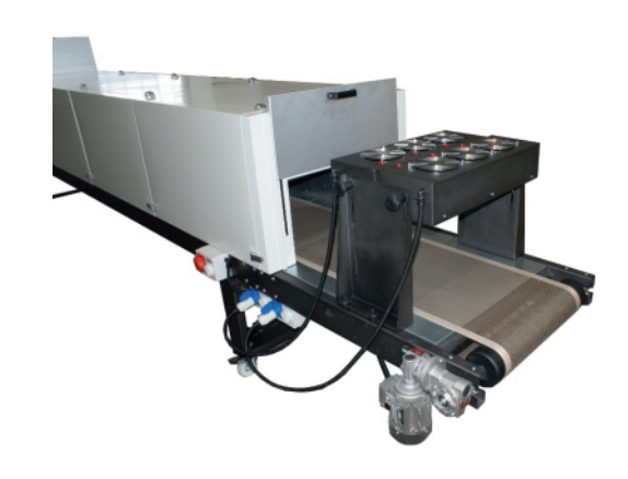
Forno Flaconi - Cooling unit (optional)