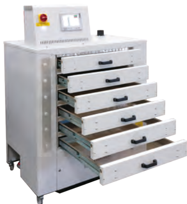
Dido Pro with 6 open drawers

Main Application: DTG Digital Printing - Entry level