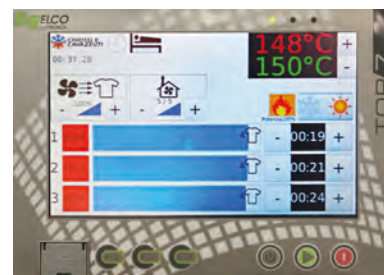
Dido Shop PLC Interface