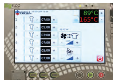
Dido Pro PLC Interface