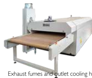
Exhaust fumes and outlet cooling hood

Other models and configurations are available