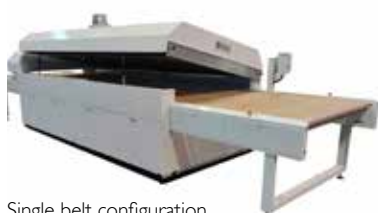
Single belt configuration