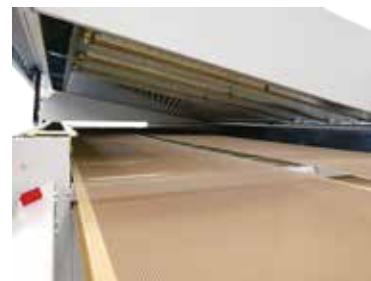
Infrared Lamps and upper section opening