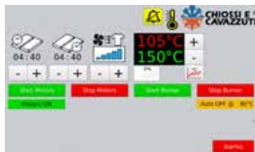
Griff PLC interface

Main Application: DTG Digital Printing & Screen Printing - Mass production