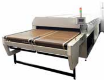
Dual belts configuration