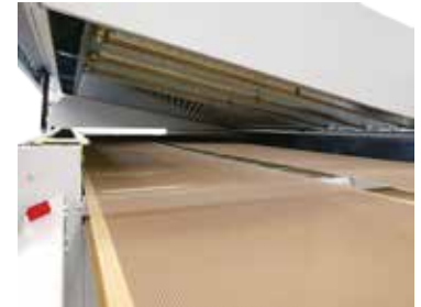
Infrared Lamps and upper section opening