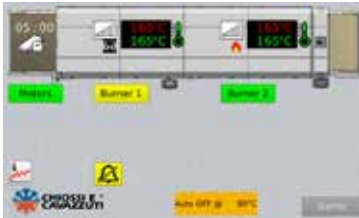
Griff PLC interface