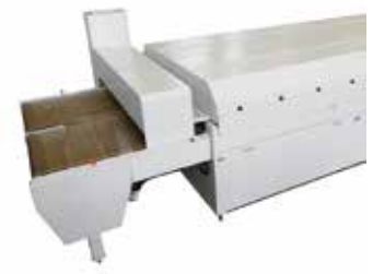
Exhaust fumes and outlet cooling hood

Other models and configurations are available