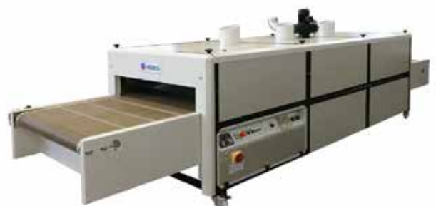
Noir 3750 with combined IR / Air system and heating chamber height increased to 300mm